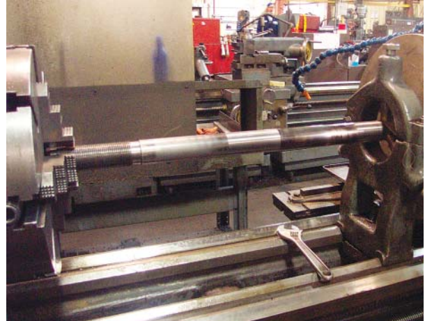
Removing old rider bands from 20" piston.