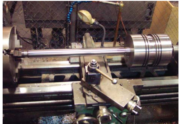
Repaired and ready for inspection.