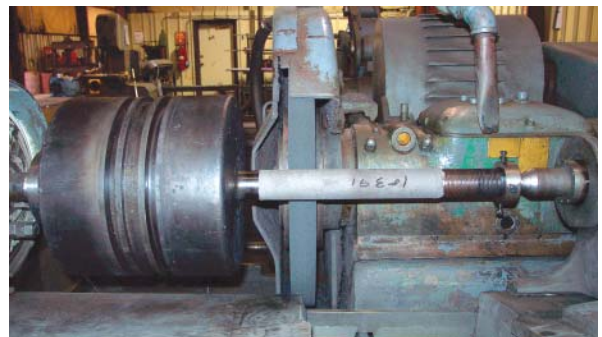
Sprayed and ready to be ground to specification.

Our local PRO Services® Centers are equipped and trained to restore all compressor piston and rods to as new condition. In addition to repair, we can manufacture new piston and rods from materials superior to standard OEM products. Our ISO-9002 Certified PRO Services™ Centers have developed procedures and processes superior to standard repair, resulting in extended service time and reduced maintenance costs to our customers. Our goal at PRO Services® is to reduce the cost of ownership, improve reliability, and increase profitability for our customers.