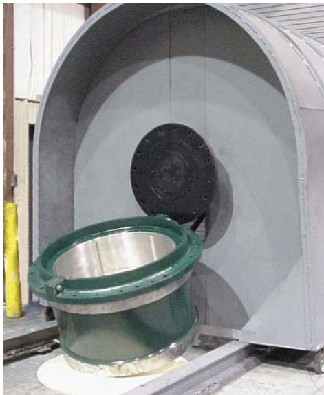
Spin Fixture to handle 120" O.D. up to 10,000 lbs.